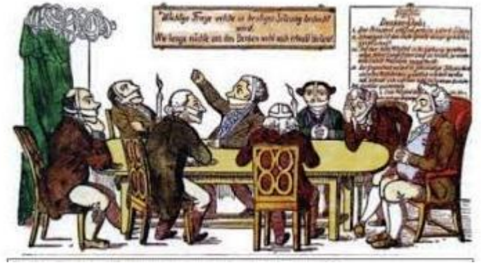
What is the caricaturist trying to depict in the picture?