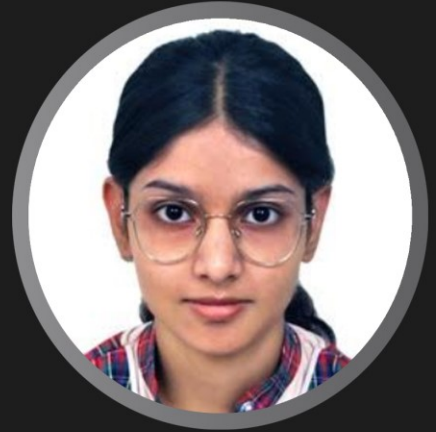
ROOPASHEE HEAD GIRL