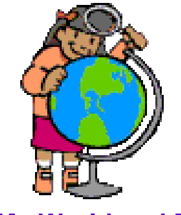
My World and Me