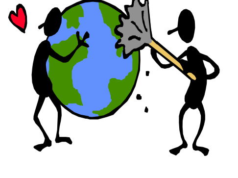
Taking Care of Our World