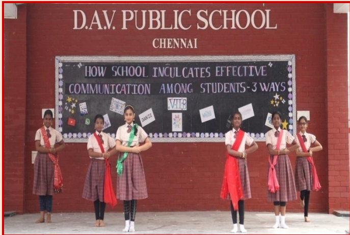
Mesmerising Dance Show