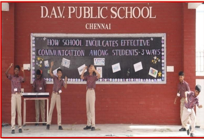
Inspiring Mime Performance