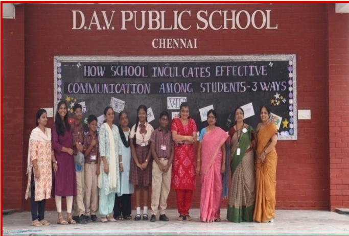
Parents applaud the Work of the Students