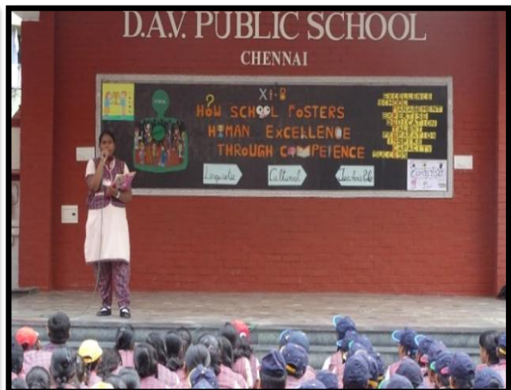
Language Skill and Literary Competence