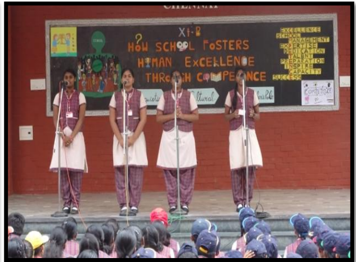
Language and Oratory Skill