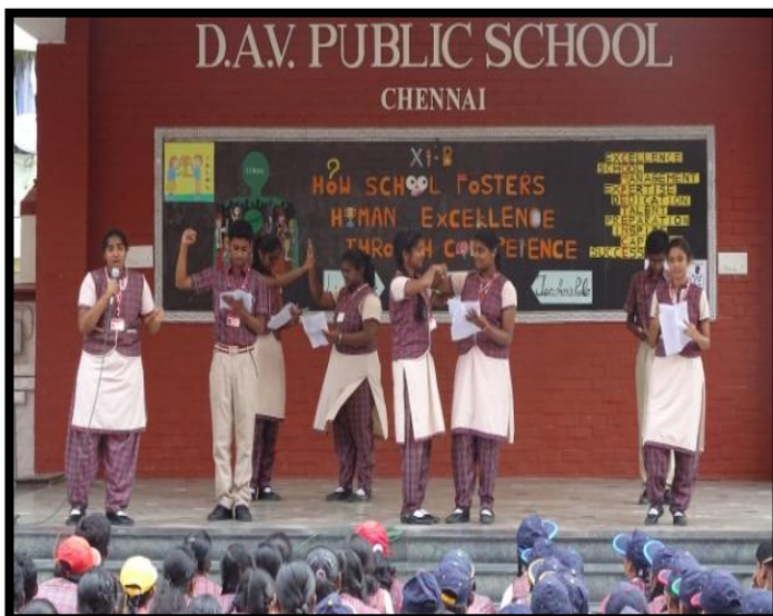
Teacher's role in Motivation of a Student