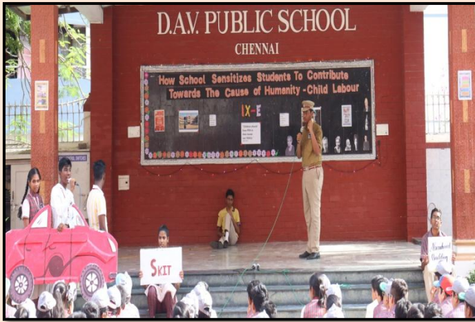
Prologue – Rescuing the Child