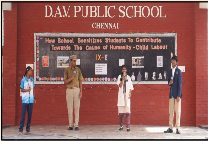
Reunion – Reminiscing about the Crucial Role of School in their Lives