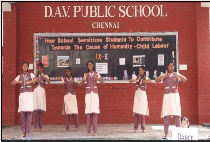
Rhythm and Passion – Graceful Manuevour of Girls