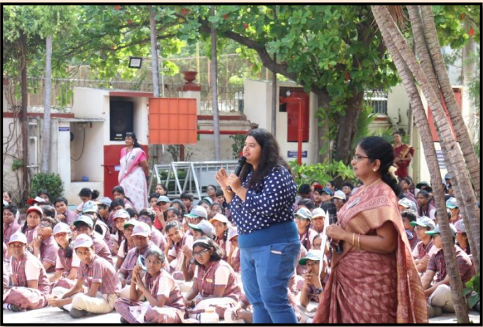
Feedback Provided by the Parent