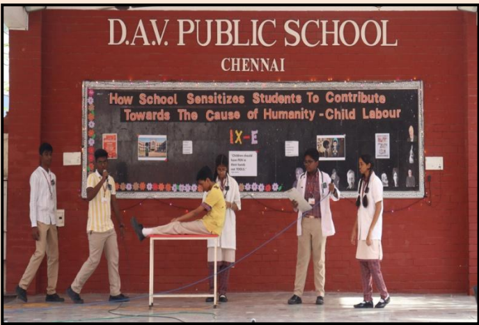
Grim Analysis – Understanding the Pain of the Child