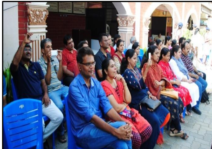
Parents Admiring the Talent of their Wards