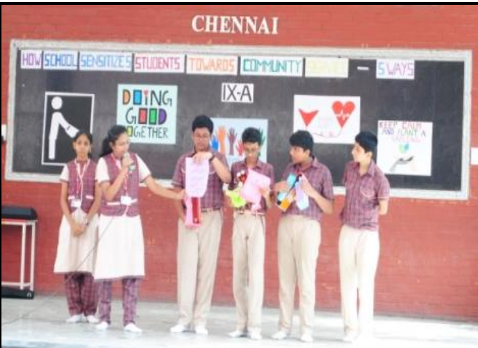
Creative Fingers who Weaved Magic for the Invitation Card