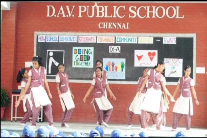
Dancers rock the stage with a peppy performance