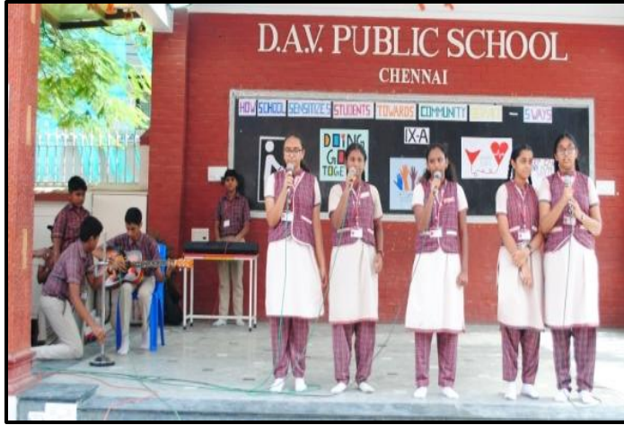
A Melodious Song rendition on Community Service