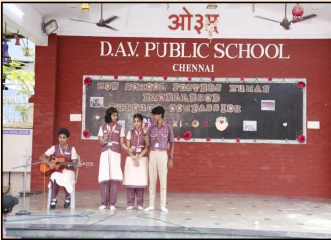
A mesmerizing song on Compassion