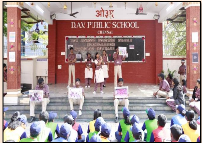
Galactic Galleria- Walkdown the memory lane through DAV Galleria