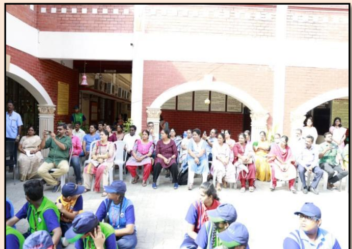
Parent's enjoying their ward's Performances