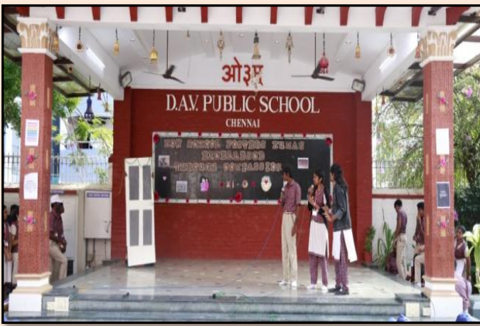
'Compassion's Cinematic Universe' - A movie spreading the message of Compassion