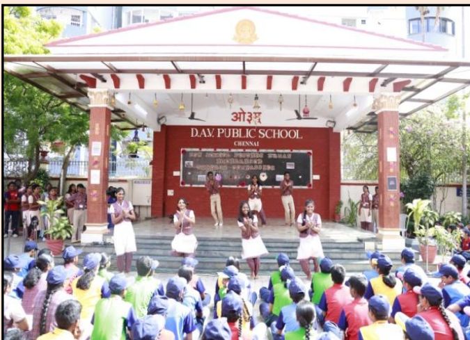
'Lightning Beats' – A celebration